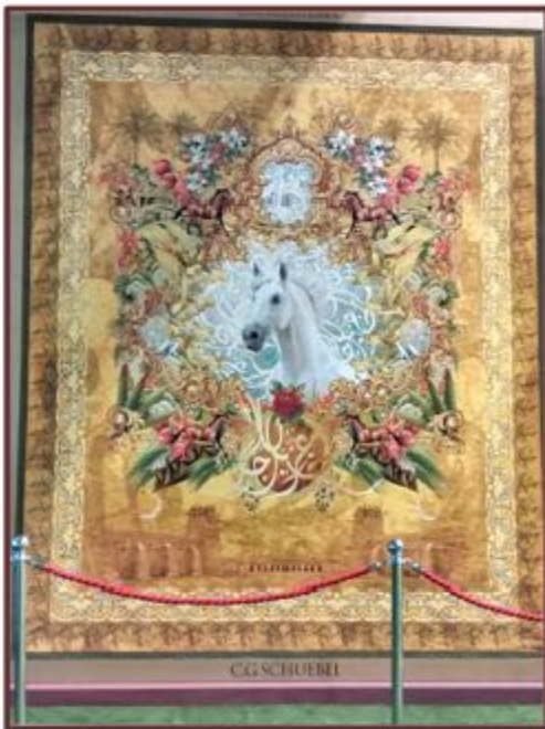
Silk Tapistry on display at Expo