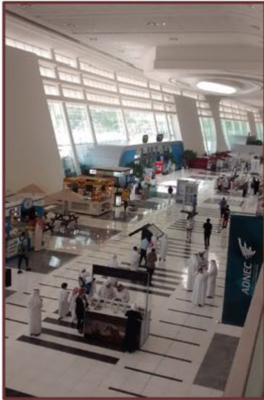
Exhibition Hall in Abu Dhabi