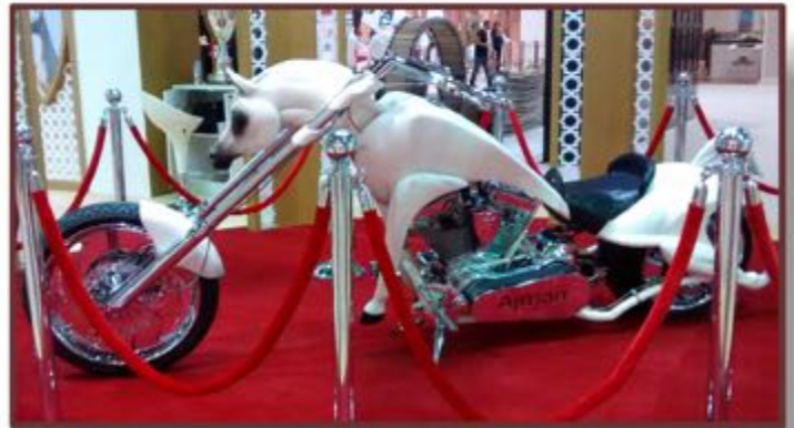
For those who require more than 1 Horse Power