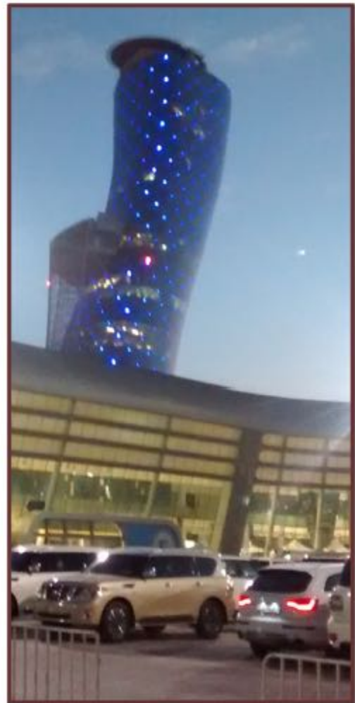
The Blue Tower in lights